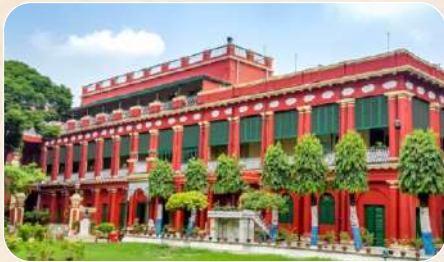
Jorasanko Thakur Bari is the ancestral home of the Tagore family.