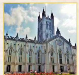
St. Paul's Cathedral