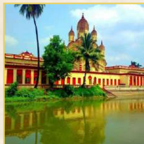
Dakshineswar Kali Temple