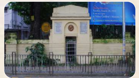
Pg Hospital(SSKM Hospital) This is the Place where Sir Ronald Ross discovered life Cycle of Mosquito that causes Malaria (1897)and Got the novel Prize (1902).