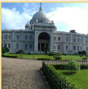
Victoria Memorial Hall

The city's former name, Calcutta, is an Anglicized version of the Bengali name Kalikata. According to some, Kalikata is derived from the Bengali word Kalikshetra, meaning "Ground of (the goddess) Kali." Some say the city's name derives from the location of its original settlement on the bank of a canal (khal).