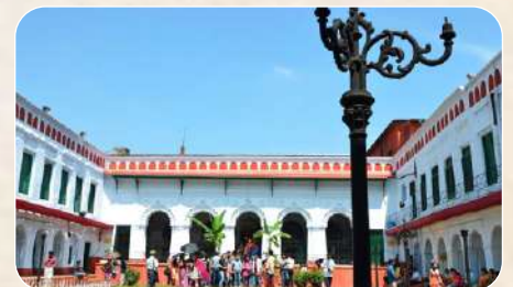
Sovabazar Rajbari Maharaja Nabakrishna Deb (1733–97), was the founder of the Shobhabazar Rajbari, the first to start Durgapuja in Kolkata