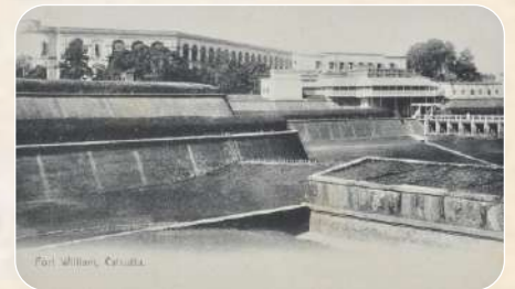
Fort William The original fort was built in the year 1696 by the British East India Company