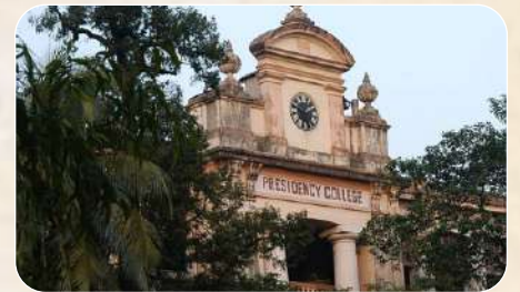
First College For Western Education in 1817 named as Hindu college, later on renamed as Presidency College