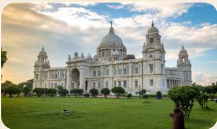
Victoria Memorial The Victoria Memorial is a large marble monument dedicated to Queen Victoria.