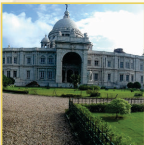
Victoria Memorial Hall

The city's former name, Calcutta, is an Anglicized version of the Bengali name Kalikata. According to some, Kalikata is derived from the Bengali word Kalikshetra, meaning "Ground of (the goddess) Kali." Some say the city's name derives from the location of its original settlement on the bank of a canal (khal).