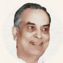
Dr B C Roy

CALCUTTA MEDICAL COLLEGE Established on 28 January 1835