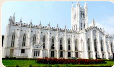
St Paul's Cathedral Established in 1847, it is the largest cathedral church you can visit in Kolkata