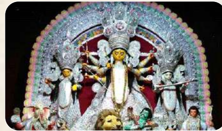
Durga Puja Durga Puja is an annual festival celebrated magnificently through the worship of goddess Durga.