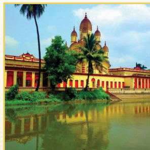
Dakshineswar Kali Temple