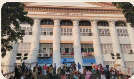
Calcutta Medical College First Medical college in Asia in 1835