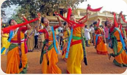
Poush Mela in Santiniketan