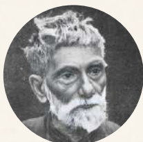
Acharya P C Ray