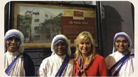
Mother Teresa Bhawan established Nirmala Shishu Bhavan in 1955