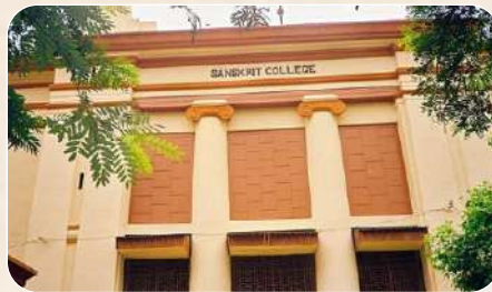
Bengal Sanskrit College Bengal Sanskrit College established in 1791