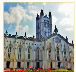
St. Paul's Cathedral