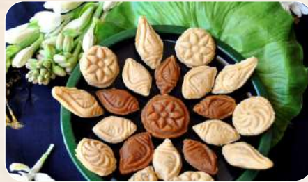
Pitha-Puli -Gurer Misti