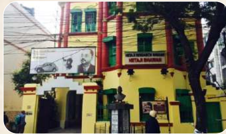
Netaji Bhawan Birth place of Netaji Subhas Chandra Bose.