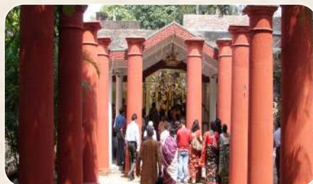
House of Sabarna Roy Chaudhury Sabarna Roy Choudhury was a Zamindar family of who sold their lands to the East India Company where Kolkata was born.