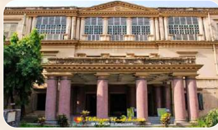
The RamMohan Memorial Museum