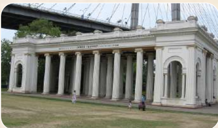
Princep Ghat is a ghat built by the British Raj, along the bank of the Hooghly River.