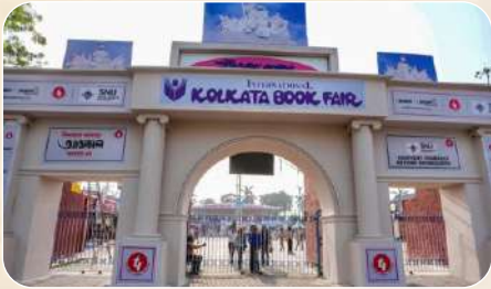
Kolkata Book Fair