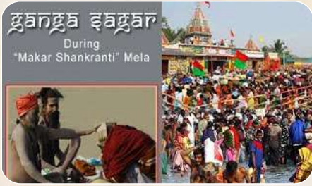
Gangasagar Snan A holy dip in the Ganges.