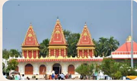
Ganga Sagar Ashram