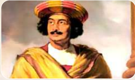
Raja Ram Mohan Roy (1772 –1833) was the pioneer of social-religious reform movement in the Indian subcontinent.