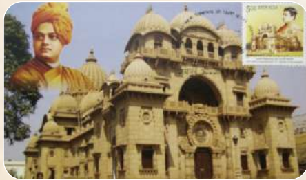
Belur Math Established in 1897 Belur Math is the Headquarter of Ramakrishna Math and Mission.