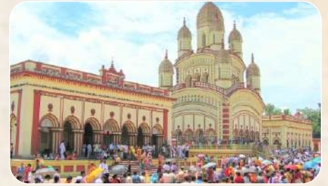
Dakshineswar Kalibari Dhakhineswar was built by Rani Rashmoni in 1855, the ashram of Thakur Sri Sri Ramakrishna