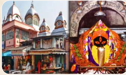
Kalighat Temple One of important Shakti Peeth in Bengal built in the 15th Century