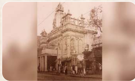
Star Theatre Star Theatre built at 1883 was instrumental in Cultural renaissance of India and Bengal in British era.