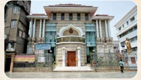
Simla House Birth Place of Swami Vivekananda (1863-1902)